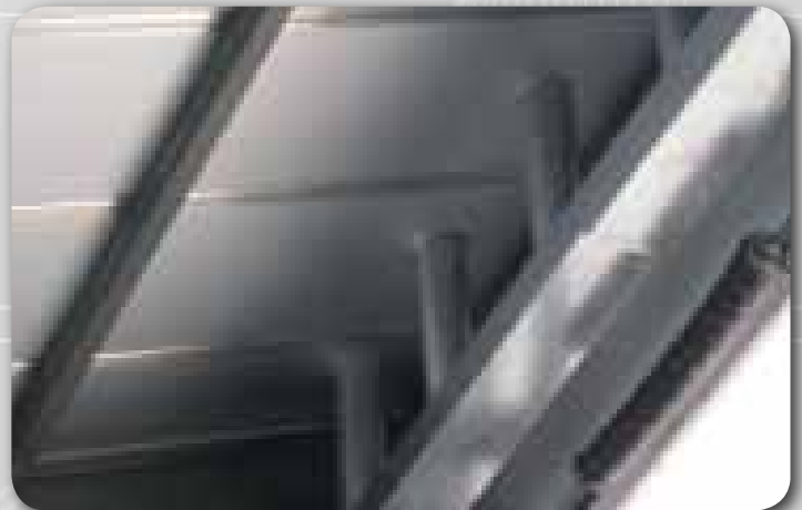
Installation on industrial and collective roofs