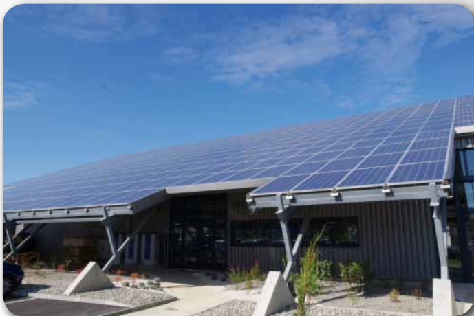
Example of an installation combined with a heat pump